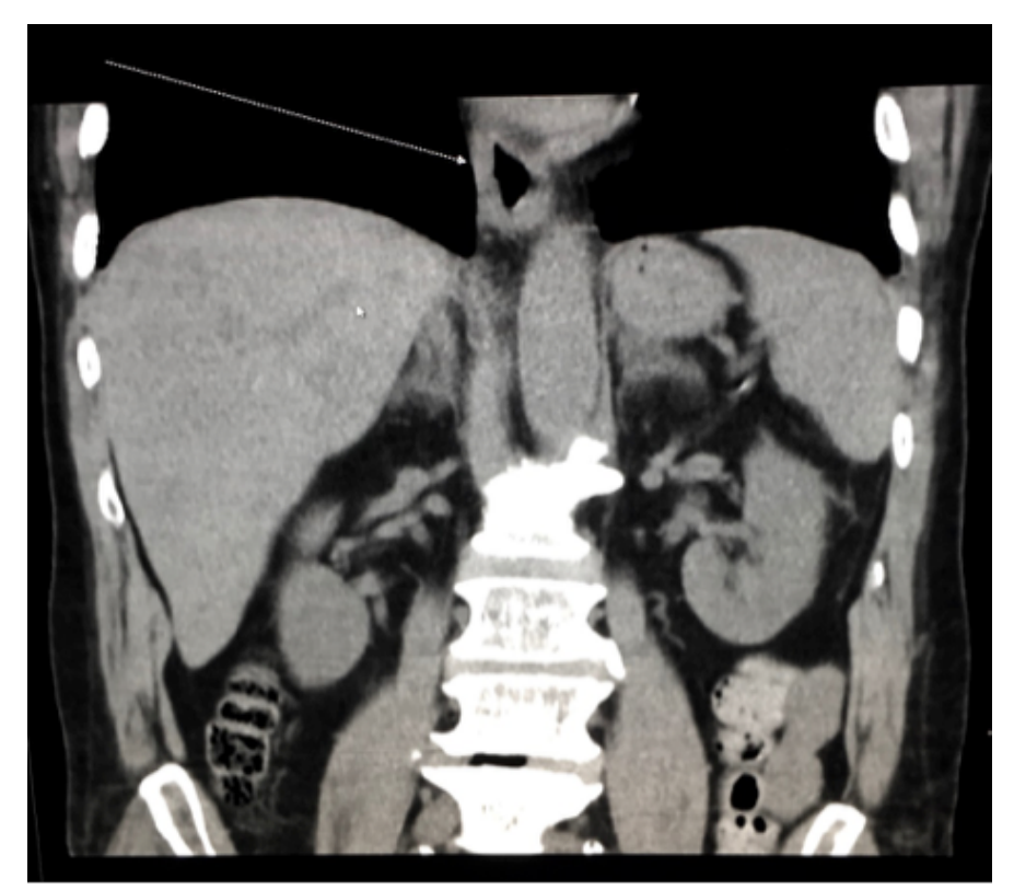
Figure 2. Abdominal CT, coronal view, showing circumferential mural thickening of the lower esophagus.

Esophagogastroduodenoscopy (EGD) showed circumferential esophagitis of the distal 6 centimeters of the esophagus with ulcerative exudate, small hiatal hernia, and mild gastropathy ( Figure 3 ). Histopathology results from esophageal biopsies from the edge of the ulcers showed herpes simplex virus (HSV), which is believed to have caused the patient's severe esophagitis ( Figure 4 ).