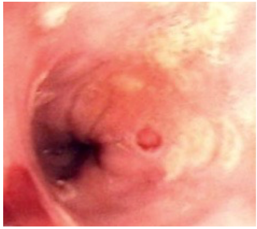
Figure 3. EGD showed ulcerative exudates.